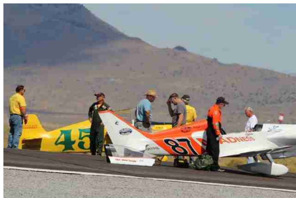
Quadnickel sits behind other Cassutts at the Reno Air Races