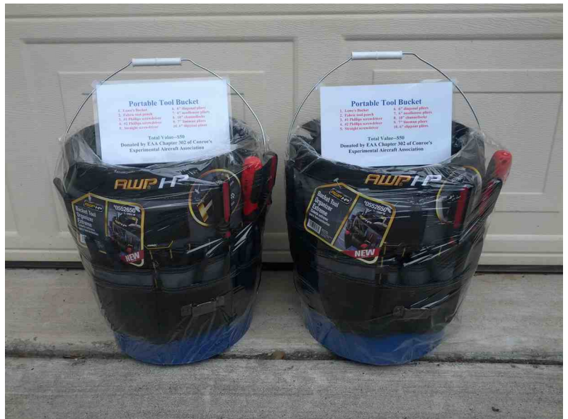
Two buckets with tool pouches and a selection of tools.