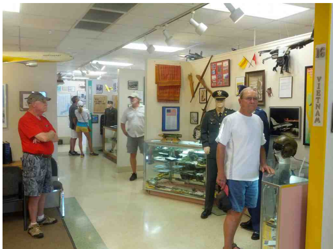
Indoor (and air conditioned) displays