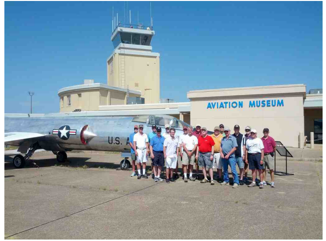
Group picture with the F-104