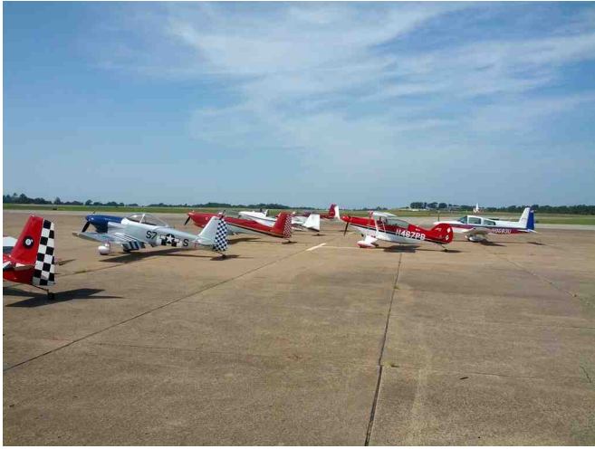
Some of the member's aircraft

Saturday, Aug. 16, we had 11 aircraft and 16 members participate in the Tyler Flyout. The museum is open Tue-Sat, 10-5, and the restaurant is open 7 days a week. Its a nice facility, and the group had a good time looking and socializing. This is why we join a club. Make sure you're part of the next outing!