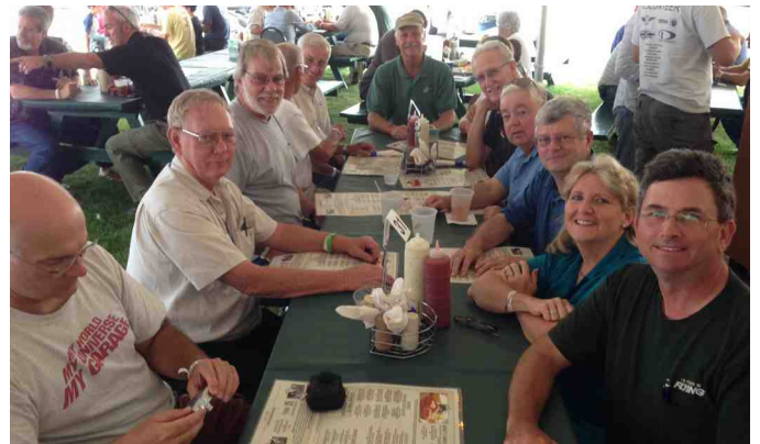
Getting ready for a Fish Fry