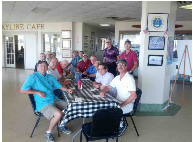
Overflow gang at the Cafe