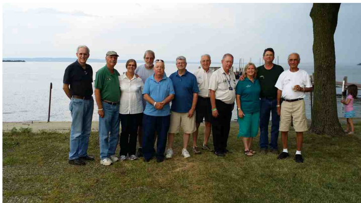
Some of the members by the Lake