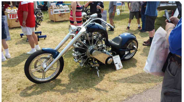
REALLY? A Radial Motorcycle?