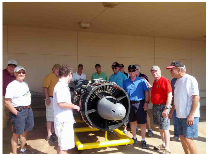
Excellent engine collection