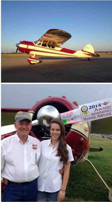
The Atkinson Cessna 195

Once again—like last year—Chapter 302 had an amazing presence at Oshkosh. We had at least 27 members at some point during the show. Make sure you are one of them next year!