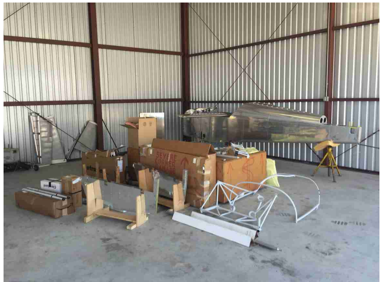
And there it is! Some assembly required.