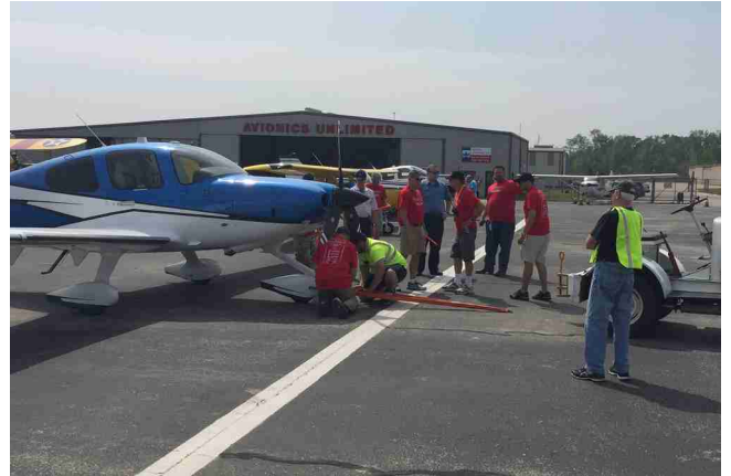
How Many Vols it take to move a Cirrus??