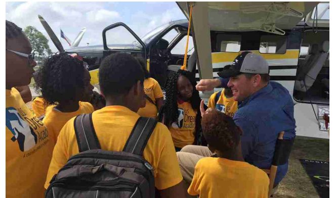
Kids came in by the busload