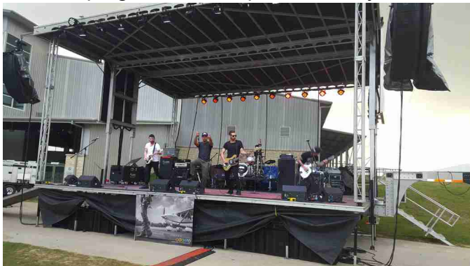
Different Bands played each evening