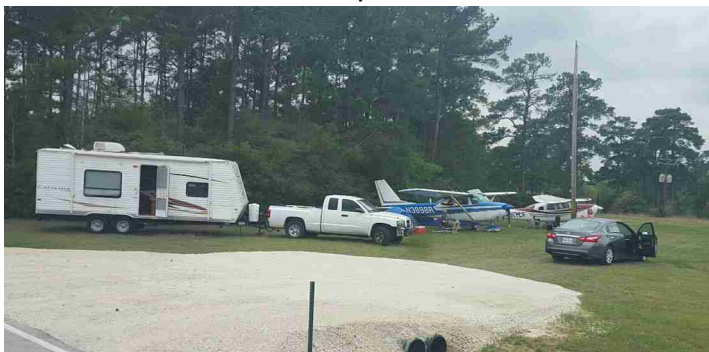
Camping North of Airport Parkway