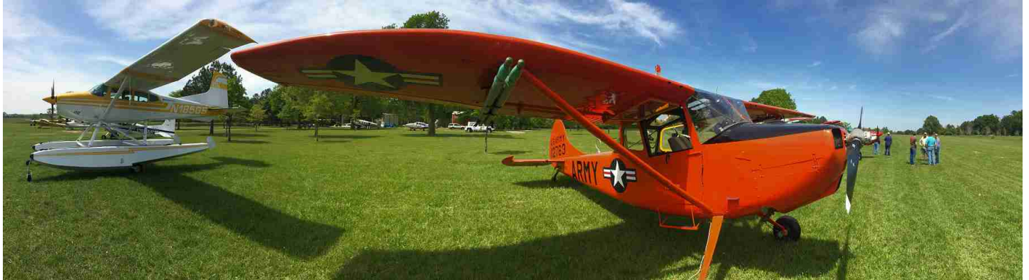
Two of Greg Smith's aircraft sit beside the newly improved runway and outbuildings