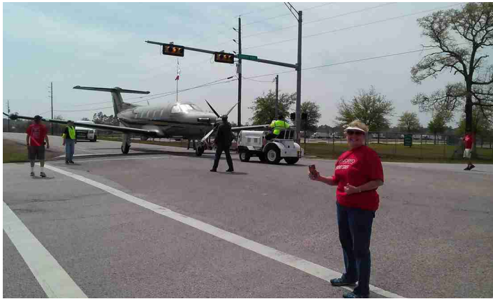
Rollin' down Airport Road