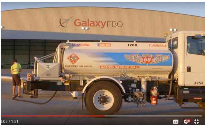
The event was based at a local 66 Dealer