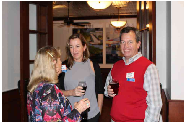
6-6:30 was a mixer with appetizers

EAA Chapter 302 held their annual Christmas Party upstairs at the Black Walnut Restaurant Saturday night, December 10 th , from 6 to 9 PM. There were 80 members present, many of whom brought gifts for the "Toys for Tots" again. Appetizers came first, then a dinner with two entree choices, followed by the White Elephant gift exchange.