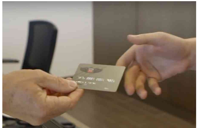
Dollar a Gallon Rebate when you use the card

https://www.youtube.com/watch?v=HJP7gse_BW4&feature