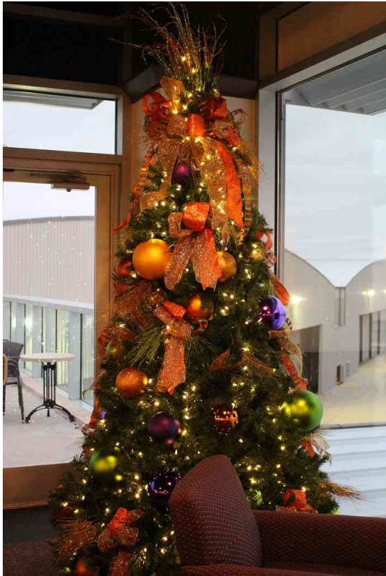
The BW tree glowed with Christmas Cheer

EAA Chapter 302 held their annual Christmas Party upstairs at the Black Walnut Restaurant Saturday night, December 10 th , from 6 to 9 PM. There were 80 members present, many of whom brought gifts for the "Toys for Tots" again. Appetizers came first, then a dinner with two entree choices, followed by the White Elephant gift exchange.