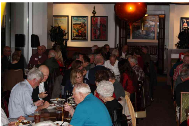
Things got quieter as eaters "dug in"